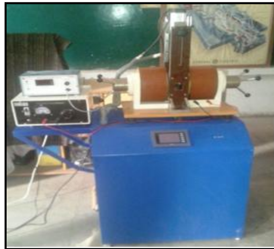
Fig. 1 Views of the set up