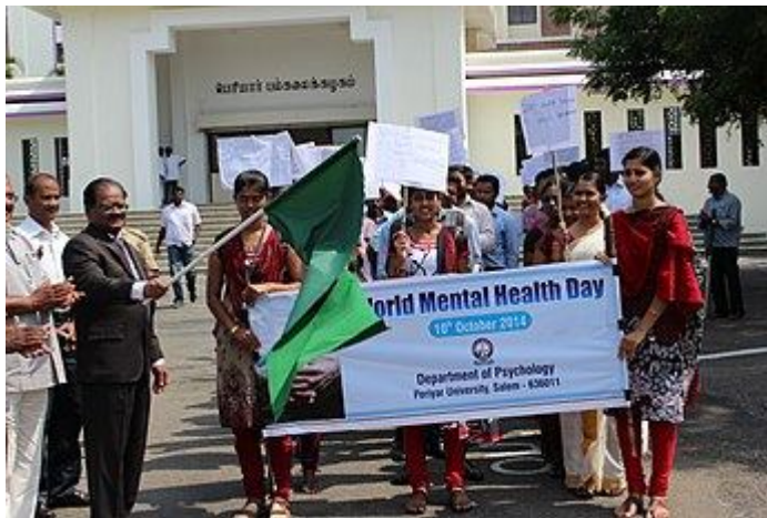
Mental Health Awareness Rally in 2014, Salem, India

Some studies in south India have found that gender disadvantages, such as negative attitudes towards women's empowerment are risk factors for suicidal behavior and common mental disorders like anxiety and depression. [67] These mental health aspects can be studied in different environments for women such as in the home, the workforce, and the educational institutions due to varying social conditions that contribute to the development of mental illnesses in some cases. [68][69] According to a 2001 study performed by U. Vindhya et al., published in Economic and Political Weekly , women tend to have greater suffering from depression and somatoform and dissociative disorders compared to men in the study. [70] Furthermore, the research attributed depressive symptoms to social interactions both in the workplace and home that fostered a sense of learned helplessness. [70] This stems from feelings of powerlessness in different types of relationships that are male-dominated and do not offer equity for women. [70] Other social stressors that contribute as influences in mental illnesses include marriage, pregnancy, family, with pressure to fit into certain traditional roles ascribed to women in India. [70]