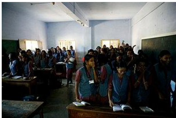
Image of a classroom in an all girls boarding school in Tamil Nadu, India

In examining educational disparities between boys and girls, the transition from primary to secondary education displays an increase in the disparity gap, as a greater percentage of females compared to males drop out from their educational journey after the age of twelve. [44] A particular 2011 study conducted by Gaurav Siddhu, published in the International Journal of Educational Development , investigated the statistics of dropout in the secondary school transition and its contributing factors in Rural India. [45] The study indicated that among the 20% of students who stopped schooling after primary education, near 70% of these students were females. [45] This study also conducted interviews to determine the factors influencing this dropout in Rural India. [45] The results indicated that most common reasons for girls to stop attending school was the distance of travel and social reasons. [45] In terms of distance of travel, families expressed fear for the safety and security of girls, traveling unaccompanied to school every day. [45] In rural areas the social reasons also consisted of how families viewed their daughter's role of belonging in her husband's house